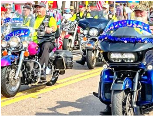
ALR Chapter 115 @ Flagler Beach July 4 th Parade

ALR Chapter 115 was proud to participate in and represent American Legion Post 115 at the Flagler Beach 4 th of July Parade!