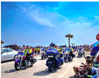
ALR Chapter 115

Chapter 115 participates in funeral and memorial services for local veterans when called upon offering a Flag Line, escort, or other services.