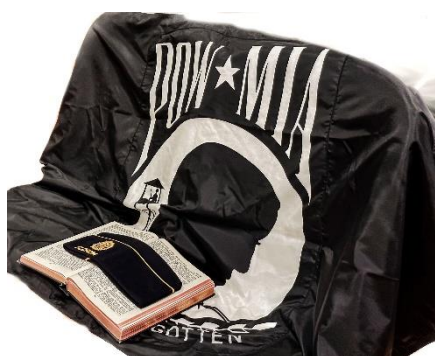
POST 115 POW/MIA CEREMONIAL CHAIR