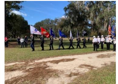
JROTC Presenting branch of service flags.