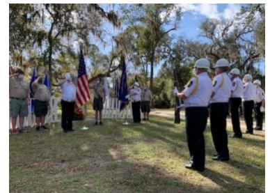
Post 115 Color Guard in attendance accompanied by Boys Scouts