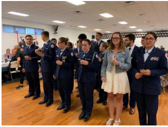
FPC AFJROTC Grog Bowl